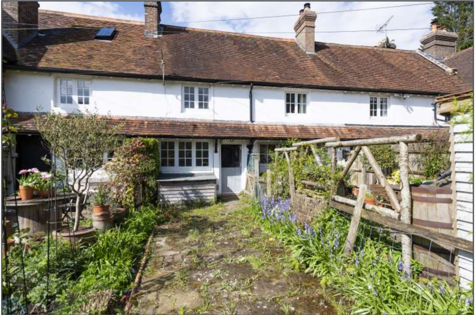
Cottage Hill, Rotherfield, TN6 3JL